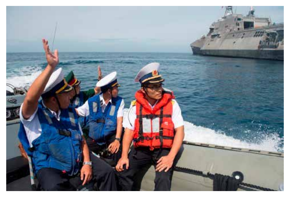
Figure 3. Friendly farewell. Members of the Vietnam People's Navy wave goodbye to the littoral combat ship USS Coronado after an exchange during Naval Engagement Activity Vietnam 2017. The engagement provides an opportunity for Sailors from the US Navy and Vietnam People's Navy to interact and share knowledge to enhance mutual capabilities and strengthen solid partnerships.

ment of an indigenous military-industrial complex allows it to safeguard its territory and current holdings in the SCS. 46 Additionally, as in Indonesia's case, geography plays a role, albeit in a different manner. Although Vietnam's border with China can pose a direct threat in the event of an armed conflict, its growing coastal missile defense systems run parallel to China's most important SLOCs, making any open hostilities costly for Beijing. Lastly, Vietnam's efforts to establish strategic partnerships with extra-regional powers like India and Japan facilitate its capacity-building efforts and allow it to increase economic diversification.